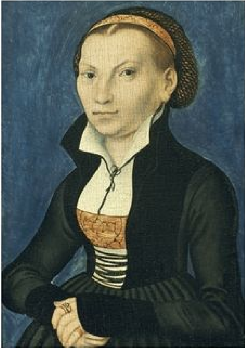
Katherine Von Bora