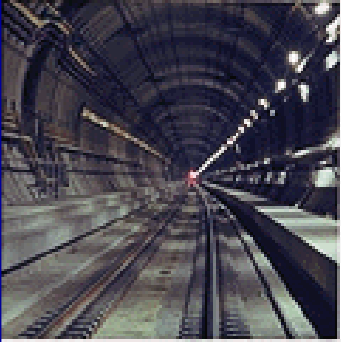
The Channel Tunnel