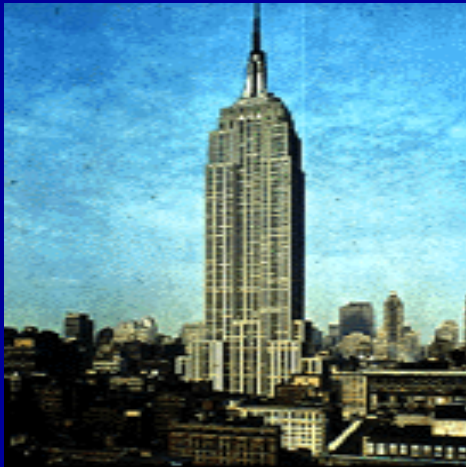
The Empire State Building