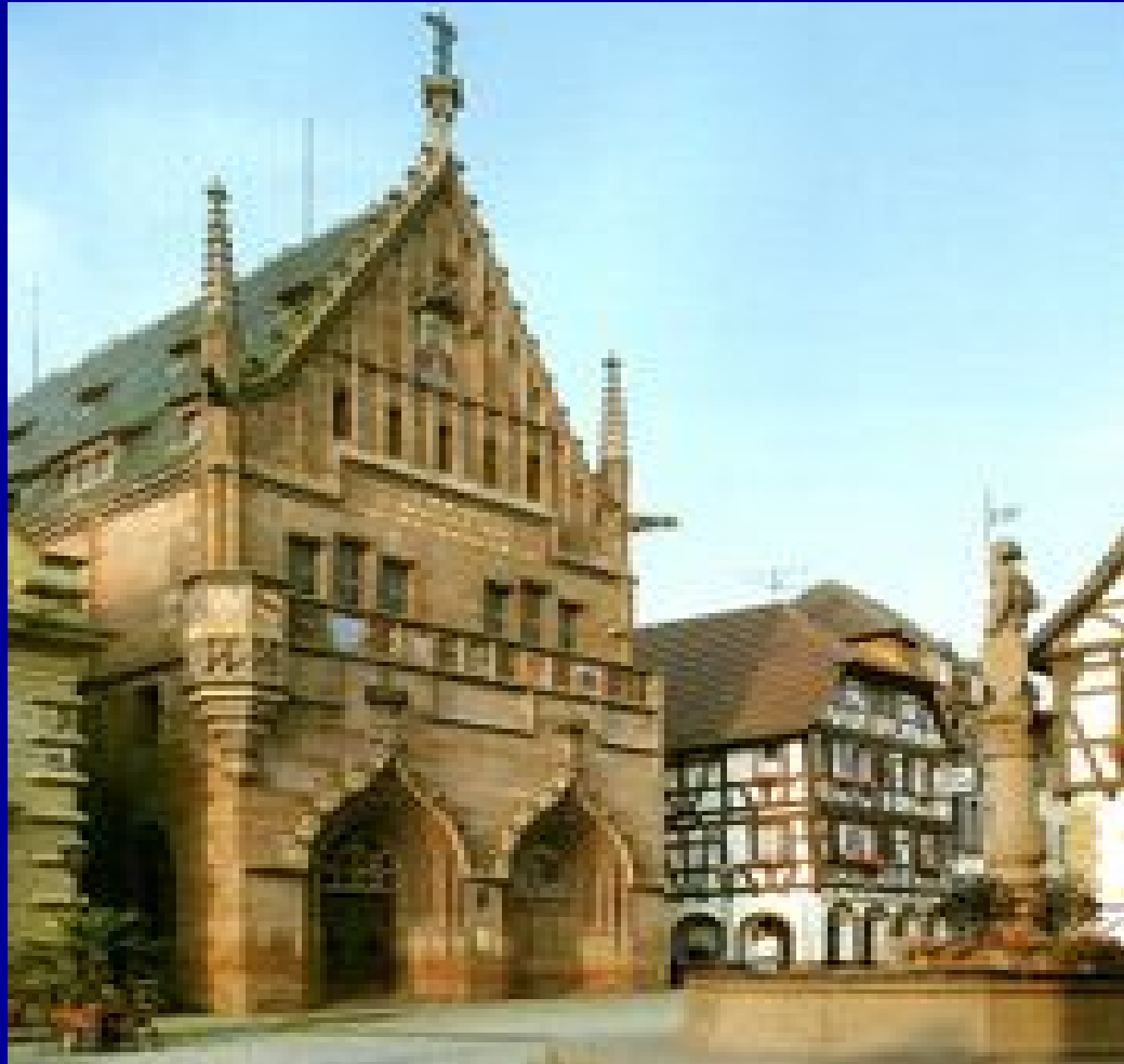
Philipp's home as a boy in Bretten.

Philipp Schwarzerd was born in Bretten in 1497.