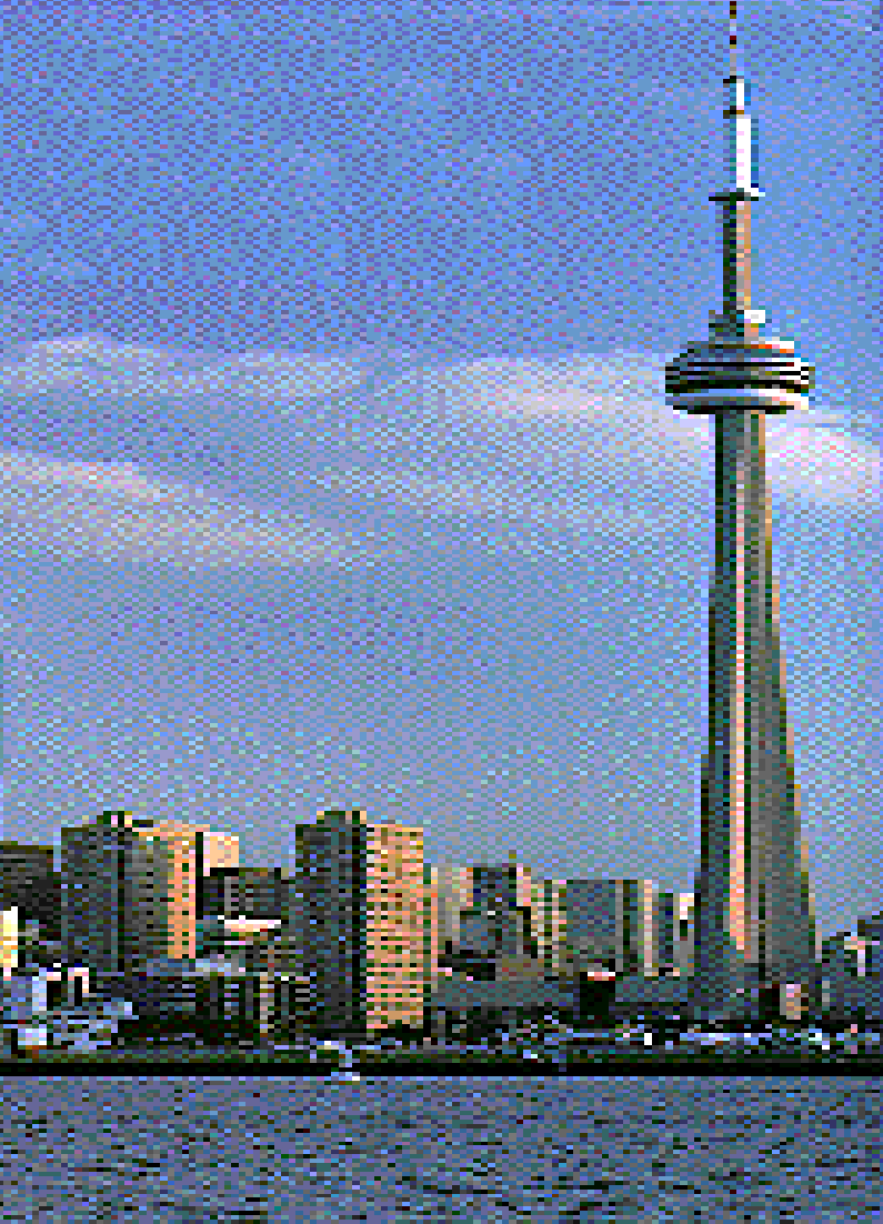
The CN Tower