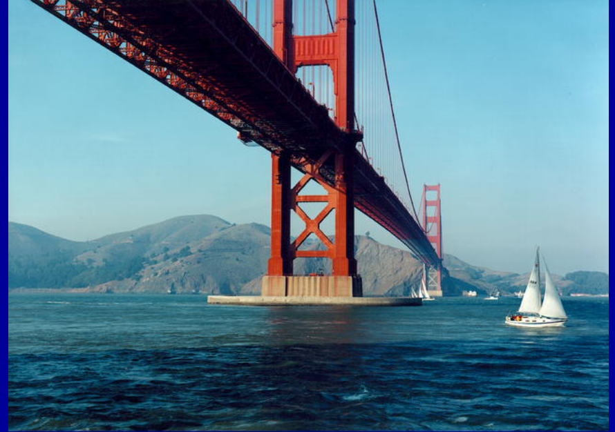
The Golden Gate Bridge