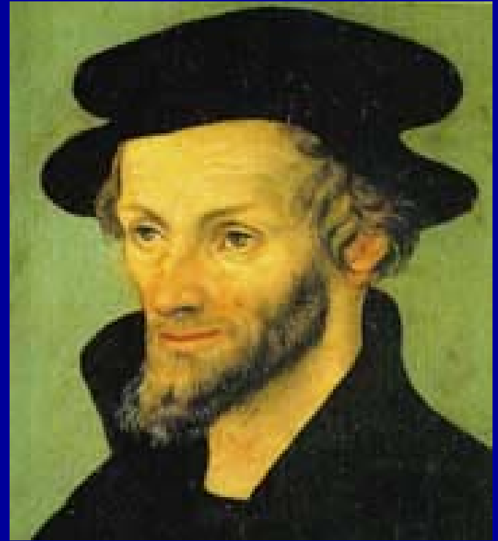
Philipp Melancthon died on April 19, 1560.

“You will come to light, you will look upon God and his Son, you will understand the wonderful mysteries which you could not comprehend in this life: Why we were so made, and not otherwise, and in what the union of the two natures in Christ consists.”