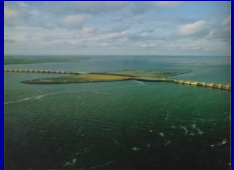
The North Sea Protection Works