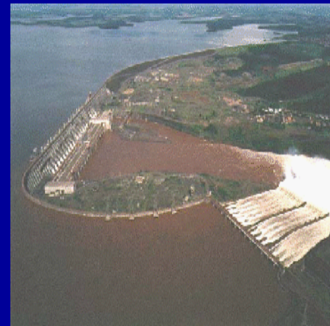
The Itaipu Dam