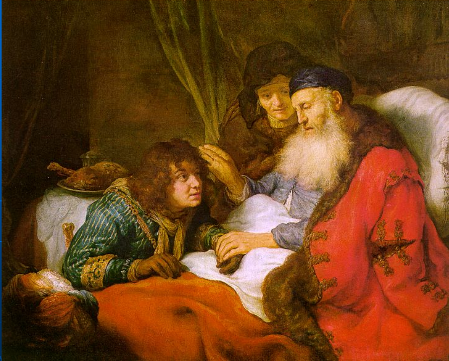
GOVAERT FLINCK 1639