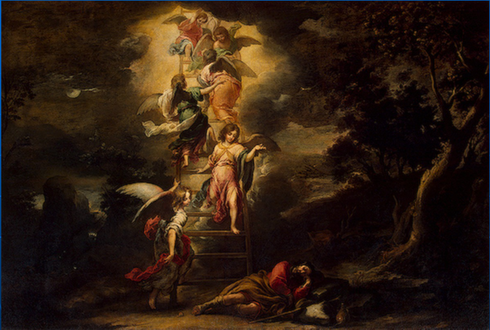
BARTOLOME MURILLO 1660s