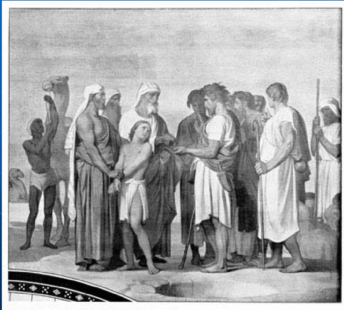
HIPPOLYTE FLANDRIN Mid-1800s