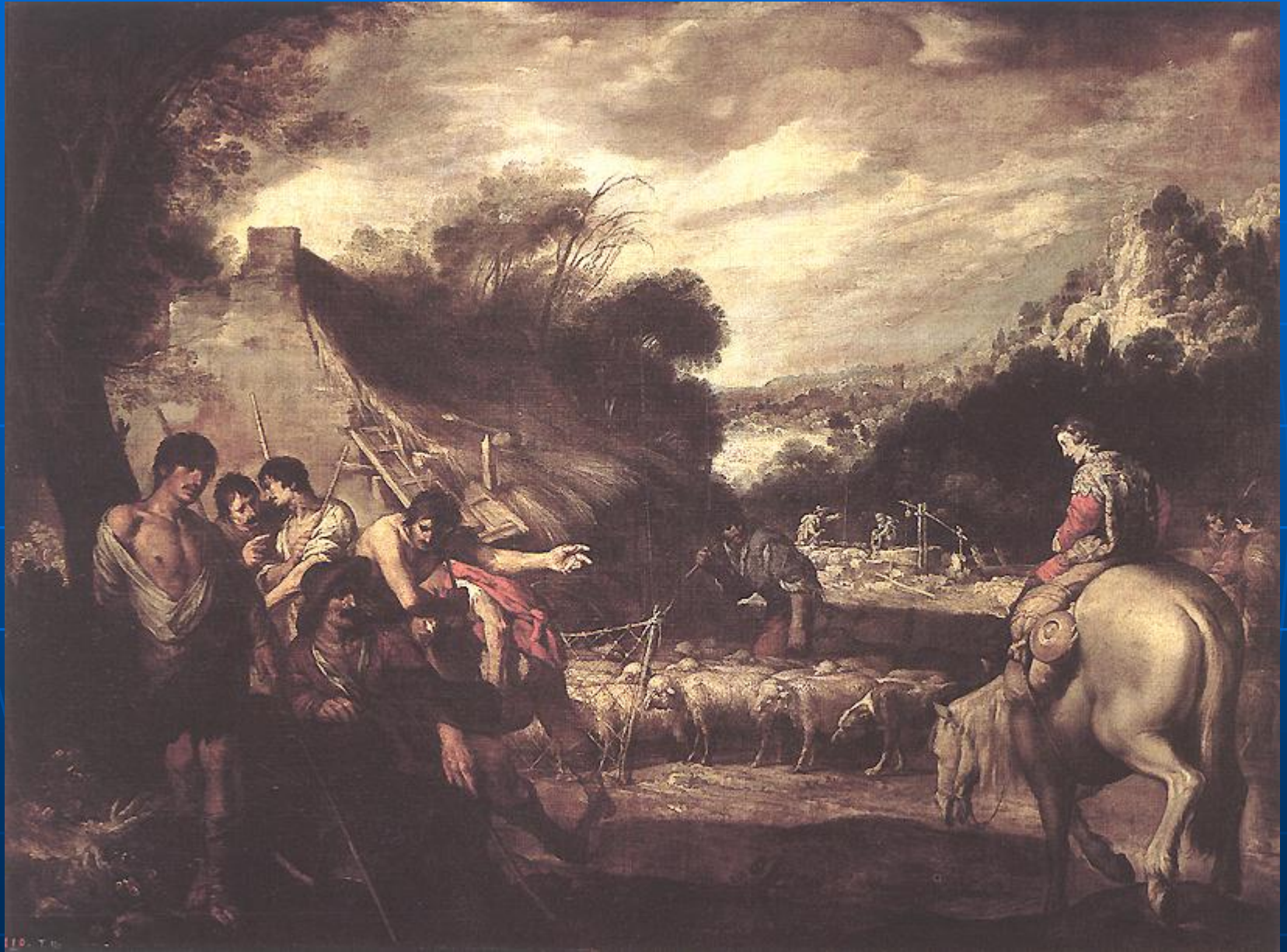
ANTONIO DEL CASTILLO - Mid-1600s