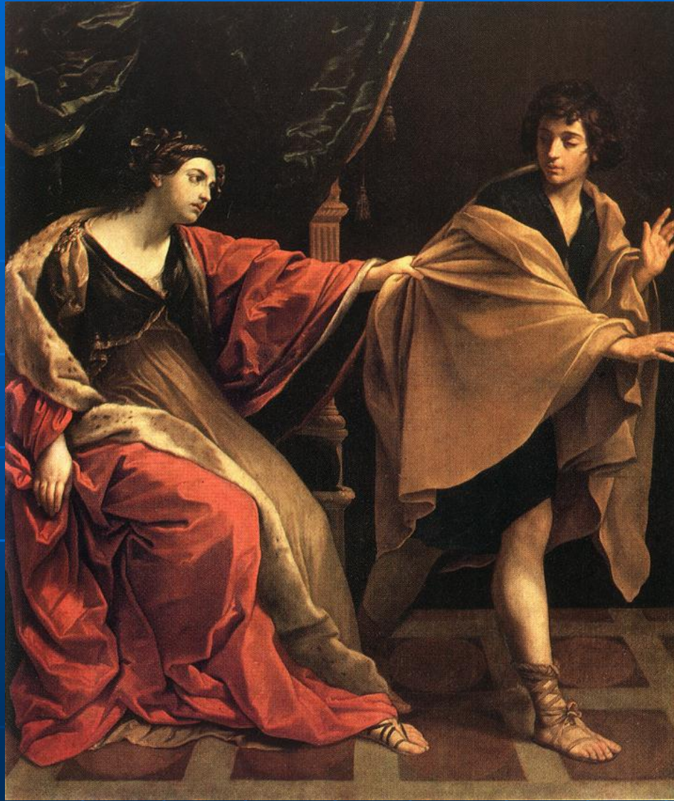
GUIDO RENI 1631