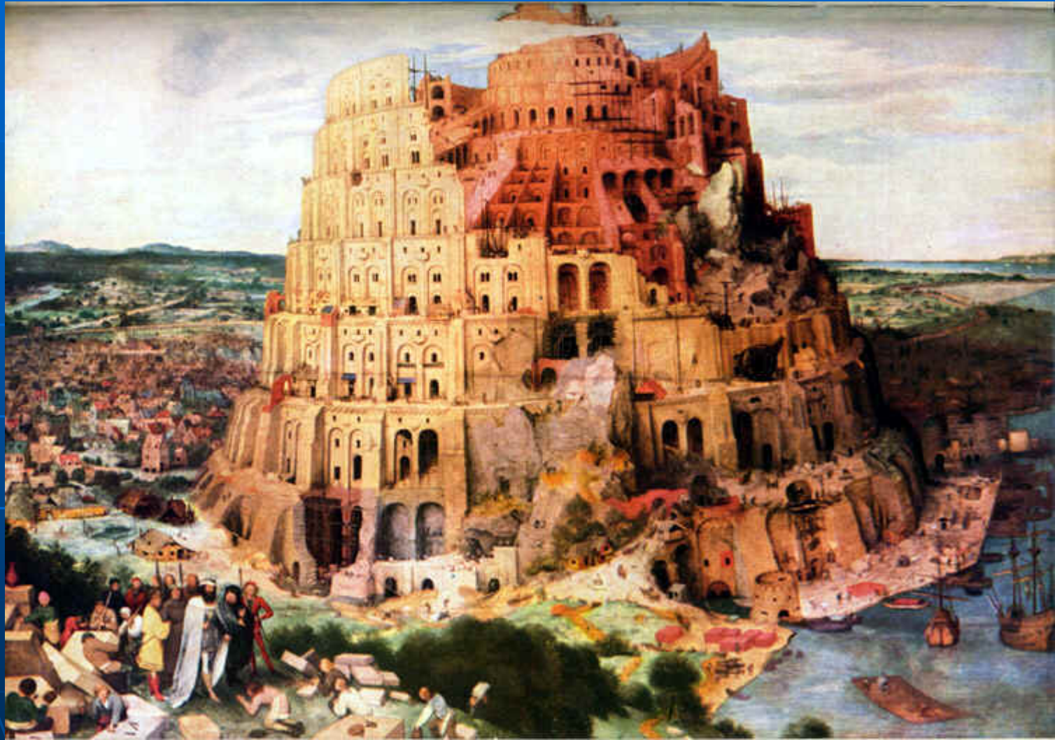
PIETER BRUEGEL THE ELDER 1563