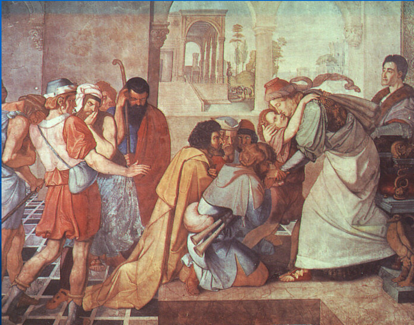
PETER VON CORNELIUS – 1800s