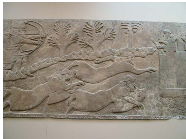
As this carving shows, the Assyrians also used goat skins as air tanks for swimming under waters.

Assyria used impressive tactics both to effect victory and to intimidate adversaries. A goal of Assyrian military might was to so impress and scare people, that no one chose to rebel and face the consequences. Assyria would use midnight attacks, battling at night (rare in that day). They took the modern equivalent of engineers that could build temporary bridges using goatskin floats and timber. They would also dam rivers