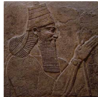
Tiglath-Pileser from a stele kept at the British Museum.

Tiglath-Pileser III 10 ("T-P") took the throne at a time when Assyria had been stagnant or even declining for decades. A good number of scholars think that T-P was a usurper, and not the rightful heir to the throne. 11 Regardless of how he came into power, T-P proved to be incredibly strong as a military leader as well as a government organizer. In his reign, which lasted from 744 to 727 BC, he changed the way kings waged war as well as the make-up of the Assyrian Empire. T-P was