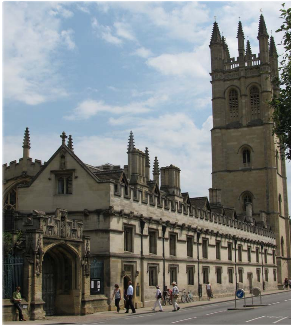
Magdalen College Oxford University