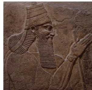
Tiglath-Pileser from a stele kept at the British Museum.

T-P 7 took the throne at a time when Assyria had been stagnant or even declining for decades. A good number of scholars think that T-P was a usurper, and not the rightful heir to the throne. 8 Regardless of how he came into power, T-P proved to be incredibly strong as a military leader as well as a government organizer. In his reign, which lasted from 744 to 727 BC, he changed the