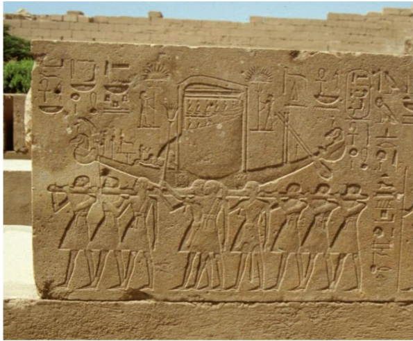
In this photo of Hatshep in Egypt one can see the typical parade carrying a god in idol form on the shoulders of men. This contrasts with Ezekiel's vision where YHWH moves by the Spirit: "Wherever the spirit would go, they went, without turning as they went."

YHWH came from the north, the direction of the annual parade of gods for the Babylonians, and the symbols of Babylon's gods were nothing more than the angelic servants of YHWH, who travelled below his chariot and throne. In ancient Near